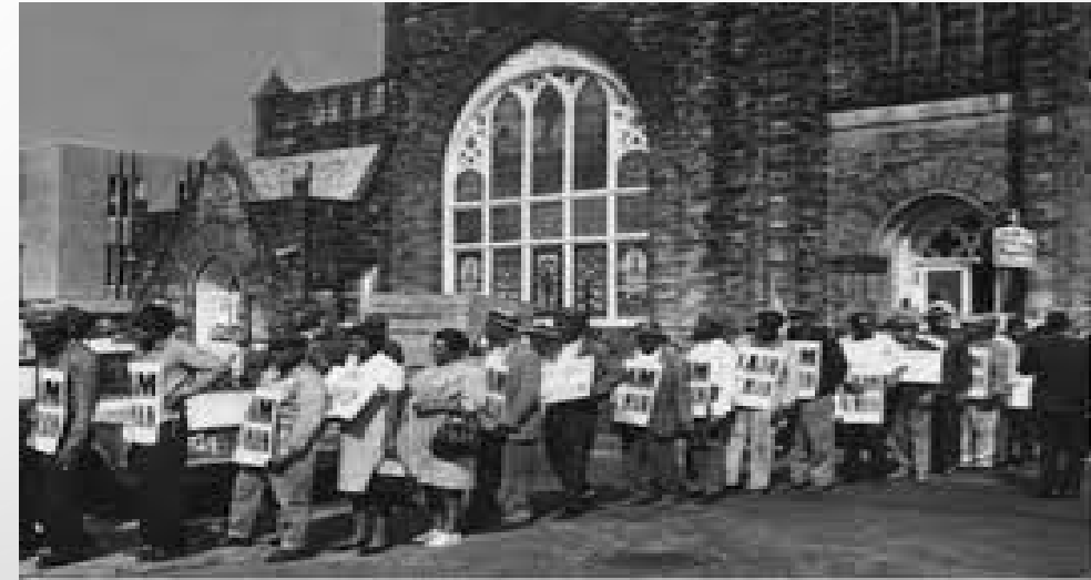
Clayborn Temple AME Church, Memphis, TN

IN 1991, ENVIRONMENTAL JUSTICE PLATFORM ADOPTED AT THE FIRST PEOPLE OF COLOR ENVIRONMENTAL LEADERSHIP SUMMIT: PRINCIPLES OF ENVIRONMENTAL JUSTICE